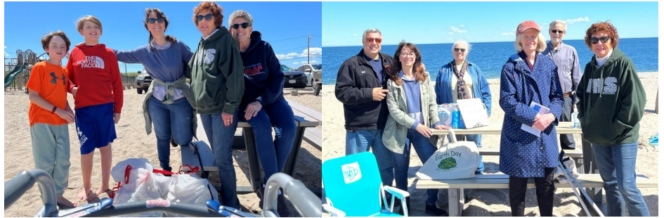
2023 Beach Clean-up Crew

Come and join us for a day of sunshine and fun as we clean up the beach!